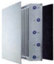
Filters phase 1 to 3: Pre filter » ElectroMax filter » Dental filter

Phase 3: the specially developed mercury adsorption filter (Dental filter) eliminates the mercury vapour concentration. In addition, this filter also reduces all kinds of medicinal smells and body odours.