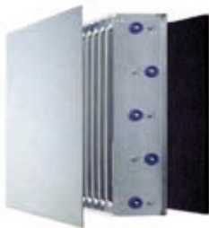
Filter construction: Pre-filter » ElectroMax filter » Dental filter

Phase 3: the specially developed mercury adsorption filter (Dental filter) eliminates the mercury vapour concentration. In addition this filter also reduces all kinds of medicinal smells and body odours.