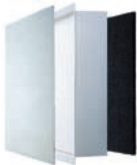
Filter construction: Pre-filter » MediaMax filter » Activated carbon filter

Phase 3: finally the activated carbon filter adsorbs unpleasant odours, like for example from cigarettes and cigars.