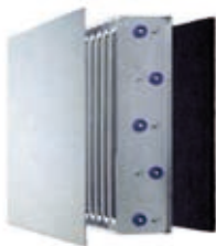
Filter construction: Pre filter » ElectroMax filter » Activated carbon filter

Phase 3: finally the activated carbon filter adsorbs unpleasant odours, like for example from cigarettes and cigars.